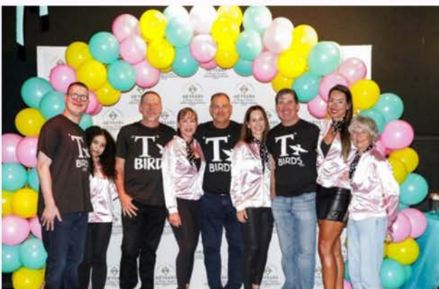
Heroes hosted by American Heritage Schools