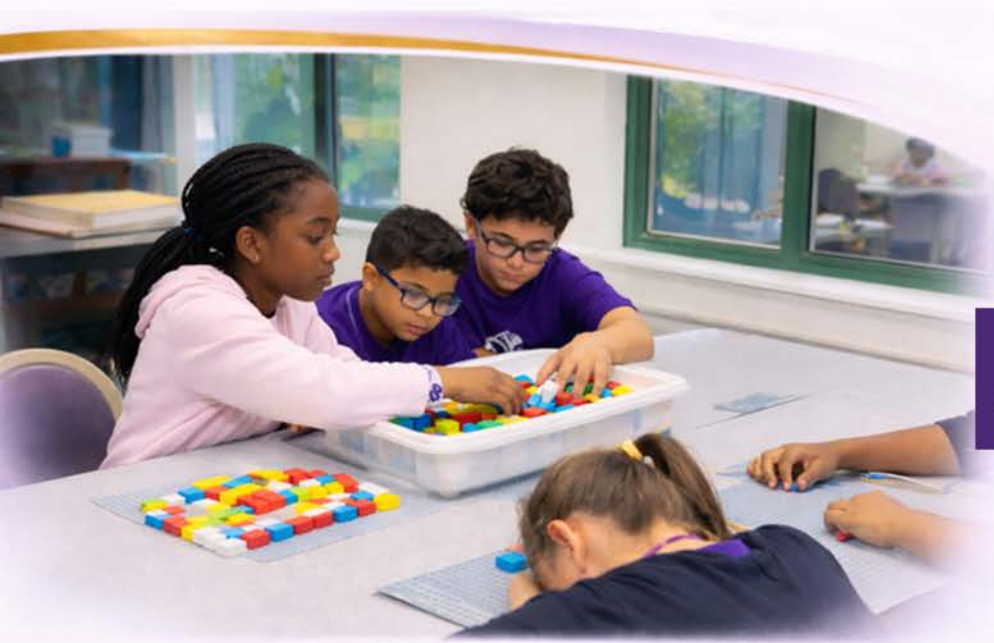
David & Jean Colker KIDS Program in action.