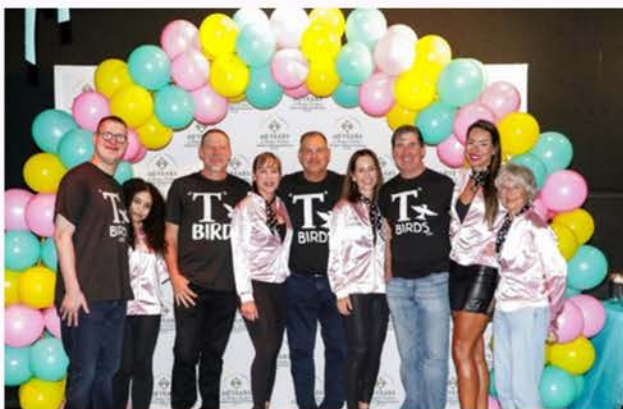
Heroes hosted by American Heritage Schools