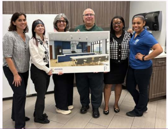
A kitchen renovation is underway at the Lighthouse.

The Jim Moran Foundation awarded a transformative $1 million grant as a part of its 25th anniversary to the Lighthouse of Broward. This substantial gift will support capital improvements and the creation of a state-of-the-art teaching kitchen in the organization's new Sunrise facility. The new kitchen will serve as a cornerstone of independence training for individuals living with vision loss – teaching essential daily living skills such as safely preparing meals, operating kitchen appliances, and using sharp tools with confidence and control. For individuals who are blind or visually impaired, a teaching kitchen is more than just a room – it's a place where confidence is built, fears are overcome, and dignity is restored through the mastery of everyday tasks many take for granted.