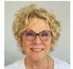
Judge Eileen O'Connor