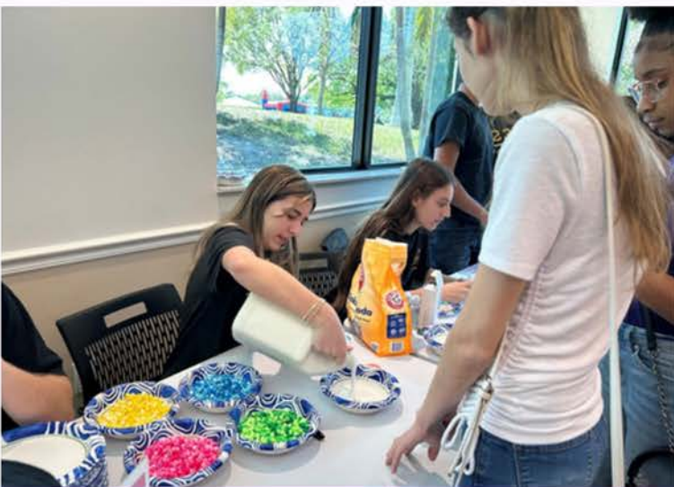
Hands-on activities at STEAM event