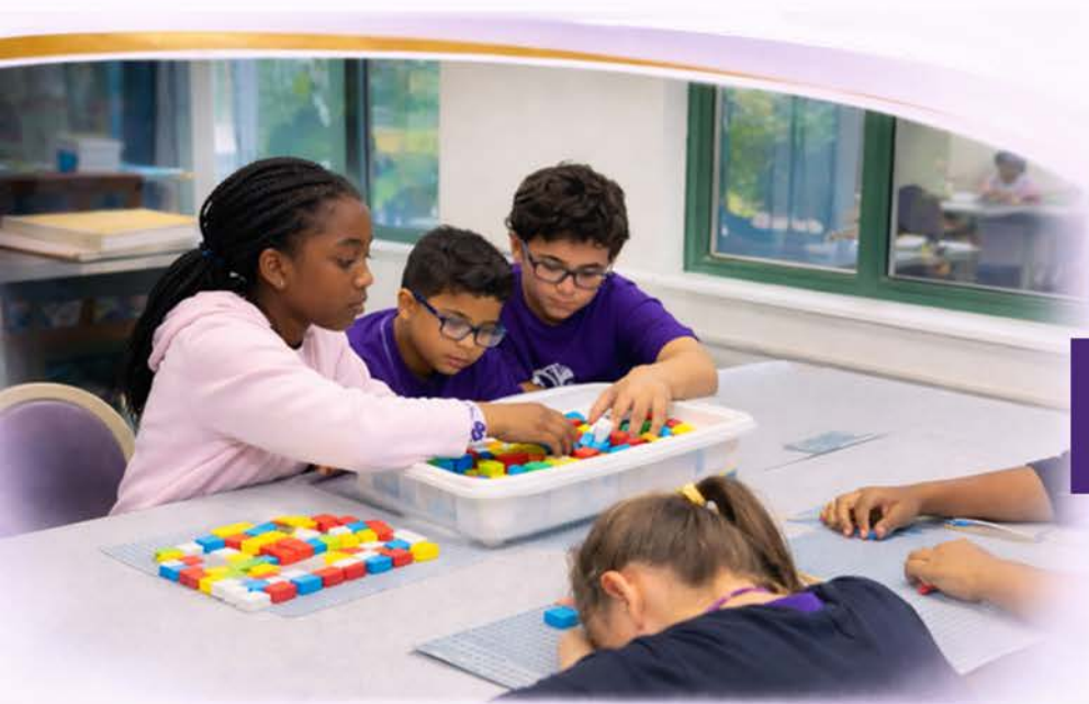
David & Jean Colker KIDS Program in action.